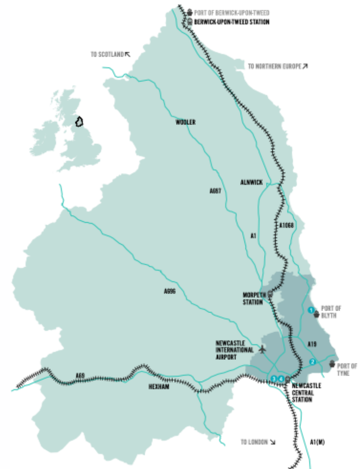
North of Tyne area – Map